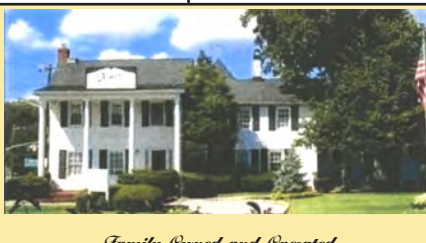
Family Owned and Operated

Towers FUNERAL HOME INC. 2681 Long Beach Rd Oceanside (516) 766-0425 www.towersfuneralhomeny.com