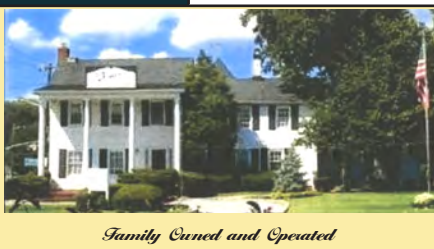
Family Owned and Operated