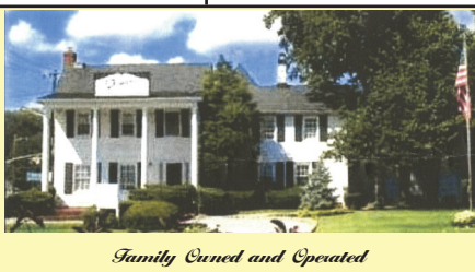
Family Owned and Operated

#223 FOR ADVERTISING: THE CHURCH BULLETIN INC., 200 DALE ST., W. BABYLON, NY 11704-1104 (631) 249-4994 • www.thechurchbulletininc.com • geosk@aol.com