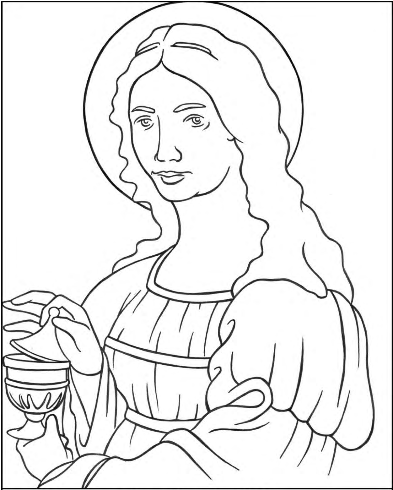
Saint Mary Magdalene