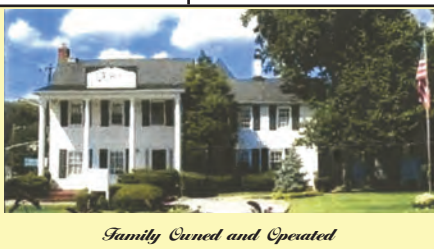
Family Owned and Operated

#223 FOR ADVERTISING: THE CHURCH BULLETIN INC., 200 DALE ST., W. BABYLON, NY 11704-1104 (631) 249-4994 • www.thechurchbulletininc.com • geosk@aol.com