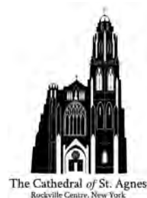
The Cathedral of St. Agnes Rockville Centre, New York

All are welcome to attend. Minors must be accompanied by an adult.