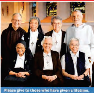
Please give to those who have given a lifetime.

George Santayana, philosopher, poet, cultural critic