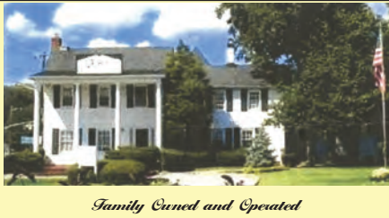
Family Owned and Operated