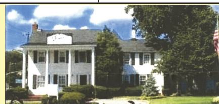
Family Owned and Operated

#223 FOR ADVERTISING: THE CHURCH BULLETIN INC., 200 DALE ST., W. BABYLON, NY 11704-1104 (631) 249-4994 • www.thechurchbulletininc.com • geosk@aol.com