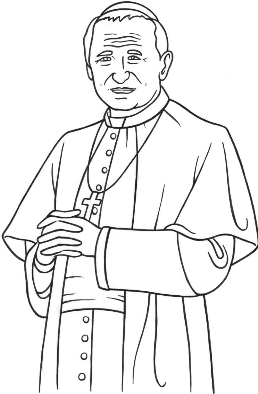
St. Pope John Paul II