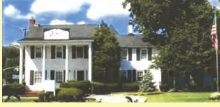
Family Owned and Operated

#223 FOR ADVERTISING: THE CHURCH BULLETIN INC., 200 DALE ST., W. BABYLON, NY 11704-1104 (631) 249-4994 • www.thechurchbulletininc.com • geosk@aol.com