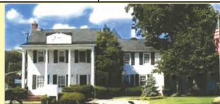
Family Owned and Operated