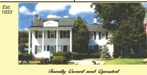
Family Owned and Operated

TOWERS FUNERAL HOME INC. 2681 Long Beach Rd Oceanside (516) 766-0425 www.towersfuneralhomeny.com Est. 1933